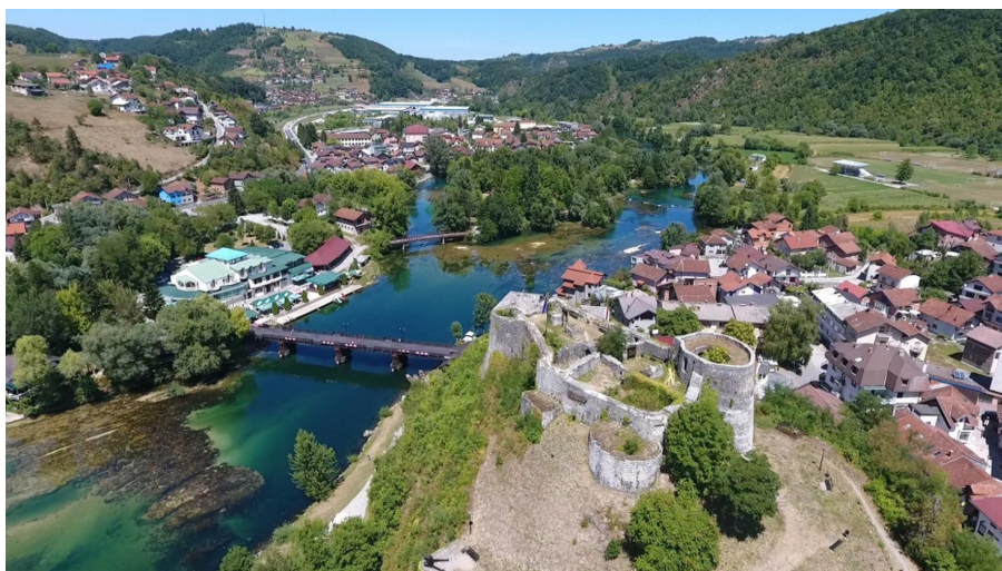
Fig. 4 — Krupa castle today