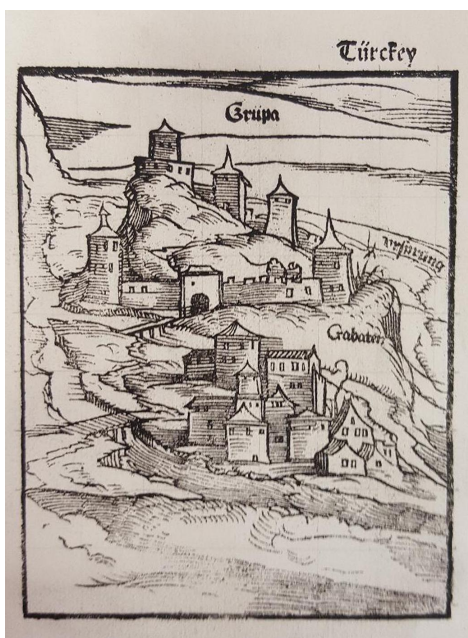
Fig. 2 — Krupa — castle and marketplace in 1530